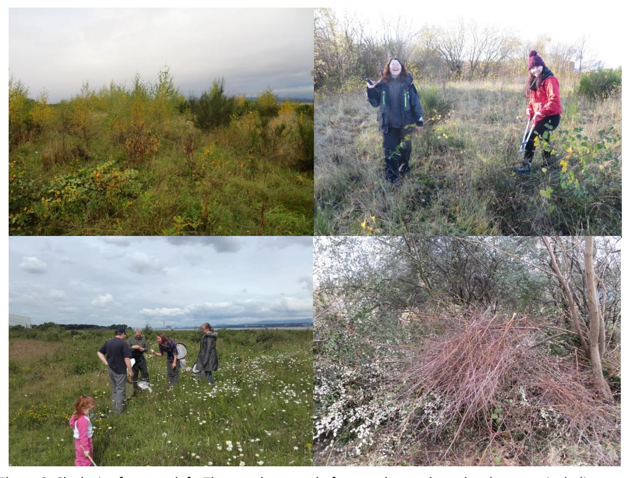
Figure 9 . Clockwise from top left- The meadow area before scrub was cleared; volunteers, including Lesley Sweeney from Falkirk Council Ranger Service clearing scrub; Habitat piles created within woodland from the cleared scrub; Pollinator species identification training on the 6<sup>th</sup> of July 2016.