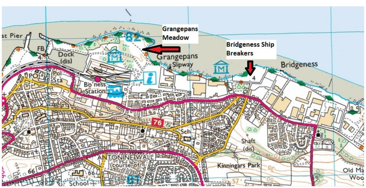
Figure 1. Location of Grangepans Meadow and Bridgeness Ship Breakers in Bo'ness.

Bridgeness Biodiversity has transformed and managed two sites in Bo'ness known locally as Bridgeness Ship Breakers and Grangepans grassland for people and wildlife to use and enjoy (Figure 1). Both sites act as an important green corridor that functionally links important habitat and allows the movement and mixing of wildlife along the foreshore of Bo'ness. Bridgeness Ship Breakers is a former brownfield site that is now designated as a local wildlife site and has been managed through this project for the UK Biodiversity Action Plan priority habitat 'Open Mosaic Habitat on Previously Developed Land' (OMH). A native species-rich wildflower and grassland meadow was created in an area of amenity grassland at Grangepans.