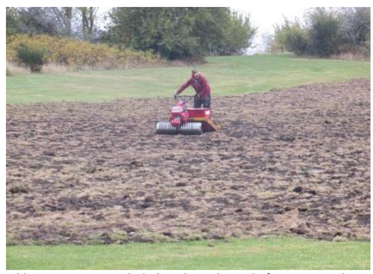
Figure 3. A roller used by contractors to help break up the soil after a power harrow had been used.

Seed used in this project was of a diverse mix of native species which included five species of annuals, four species of biennials, 25 species of perennial wildflowers and six species of grasses (Table 1). An additional amount of the hemi-parasite and annual Yellow rattle ( Rhinanthus minor ) was sown separately into the meadow to help control the growth of any unwanted grasses. Whilst capable of carrying out its own photosynthesis, Yellow rattle is dependent upon grasses for additional supplies of carbohydrates and minerals. By drawing nutrients from their host it reduces the grasses growth and this helps maintain an open sward of vegetation creating more space for wildflowers to grow and set seed.