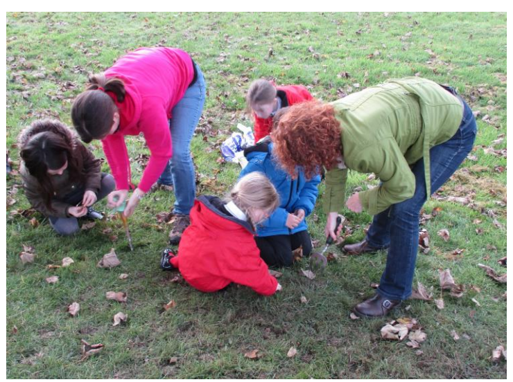
Figure 6 . Children attending Carriden Community After School club helping to plant plug plants and extend the meadow area at Grangepans.

An additional area of grassland meadow was created alongside one of the sown areas to remove one of the regularly cut strips that ran alongside woodland (the bottom right area marked in red in Figure 2). This additional area totalled 0.1 hectares in size and was planted with over 2,310 plug plants of 13 native wildflower species (including Field scabious ( Knautia arvensis ) and Red campion ( Silene dioica ) (Table 2). Volunteers from the Inner Forth Landscape Initiative (IFLI) trainee scheme and Carriden Community helped plant the plug plants on the week of the 16<sup>th</sup> of May (Figure 6). Six IFLI trainees and their supervisor came every day this week to plant the majority of the plug plants. At least 12 children and 11 adults from Carriden Community After School club helped to plant the plug plants on the 19<sup>th</sup> of May. The children learnt about the importance of native wildflowers for pollinators and what flowers they should expect to see within the meadow over the summer and in future years.