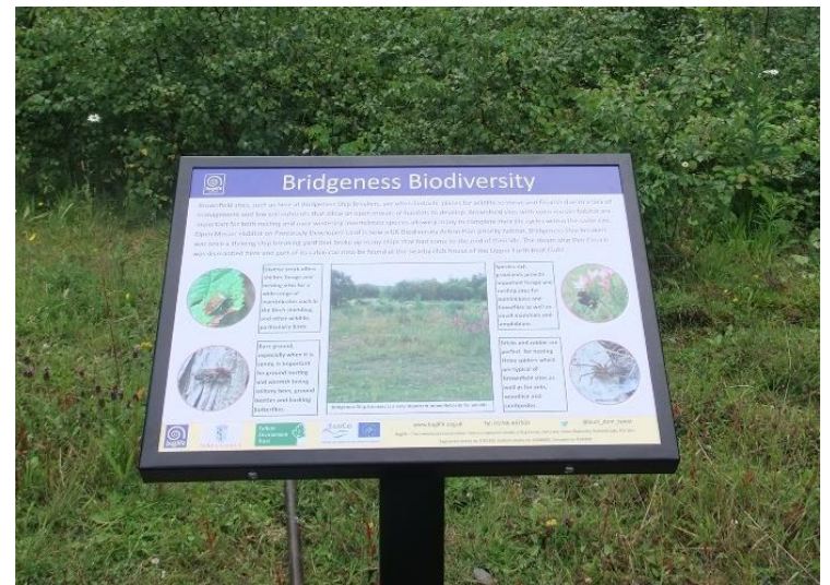
Figure 10 . Interpretation panel at Bridgeness Ship Breakers about the importance of OMH for biodiversity.

The route of the John Muir Way passes through this wildlife site and an interpretation board with information on the importance of OMH for wildlife was installed for visitors and locals to read and enjoy (Figure 10).