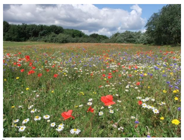
Figure 4 . Annuals in flower at Grangepans Meadow on the 14<sup>th</sup> of July 2016.

In the summer of 2016, the annuals put on a fantastic display showing a range of reds, yellows and blues (Figure 4). This then gave time for the perennials to develop through the summer and a variety of these, including Wild carrot ( Daucus carota ) and Red campion ( Silene dioica ) where visible from July onwards (Figure 5).