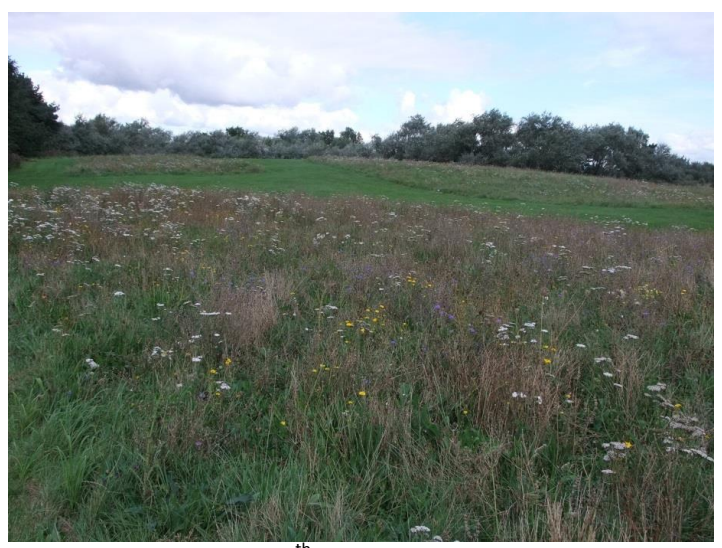
Figure 5 . The meadow as observed on the 20<sup>th</sup> of September 2016 with far fewer annuals but larger numbers of perennials present.