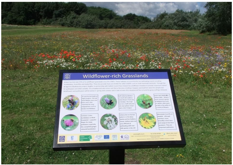
Figure 7 . The interpretation board at Grangepans Meadow.

The route of the John Muir Way passes along the foreshore of Grangepans Meadow. An interpretation board was installed with information on the project and the importance of wildflower-rich grasslands and what species of plants and insects that people may see (Figure 7). This interpretation board is next to a bench which has recently been installed in the area through another project.