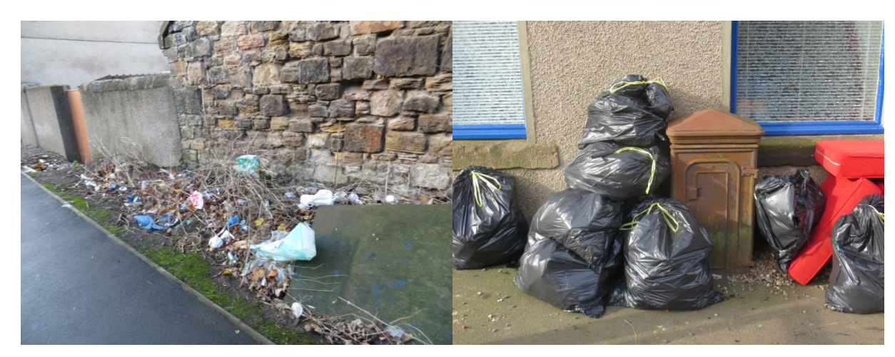
Figure 8. Litter has been a big problem at this site and so far over 40 bags have been removed.

Through these events volunteers have enjoyed seeing the benefit of their work. For example, results are easy to see once an area has been cleared of litter and similarly when clearing the meadow of birch scrub the results were instantaneous (Figure 8 and 9).