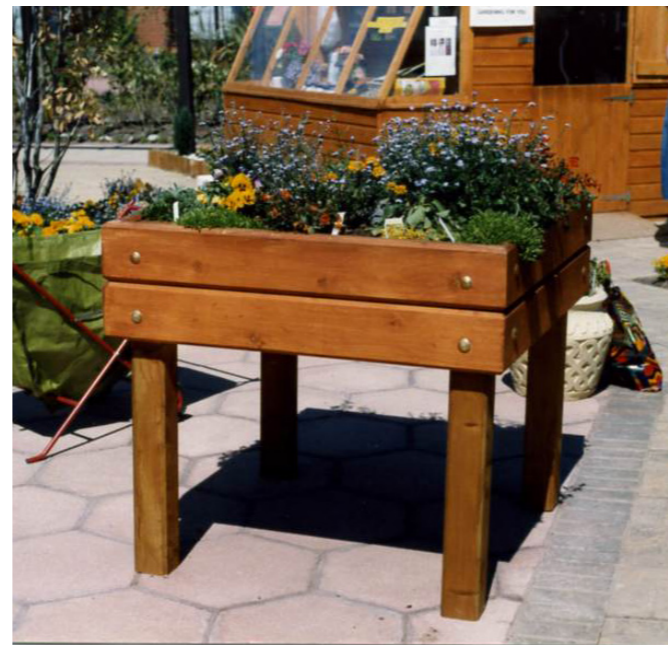
Photo showing finished appearance of planter, except that there should be two domed screws per horizontal edge board rather than only one.