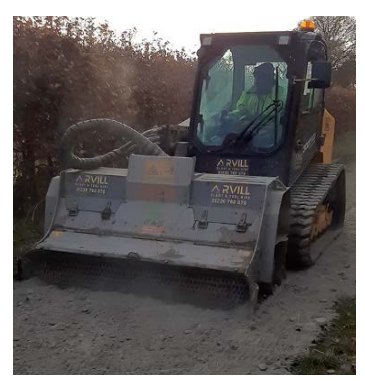
Figure 3 – Smart Surface powder being mixed into the soil using Skidsteer Mounted Crusher

The soil is then levelled again to remove undulations from the mixing process. Once this has been carried out, the soil is then compacted using a roller until the specified level of compaction has been achieved