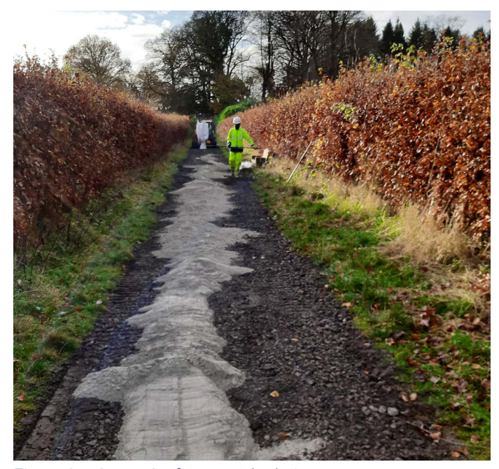
Figure 2 – Smart Surface powder being dispensed over the specified area

The Smart Surface powder is then dispensed over the area (Figure 2). The quantity per m2 depends on the target % binder required and the target treatment depth. This is dry mixed into the soil using the skid steer mounted crusher or other similar implement (Figure 3). Water is then added to the soil and the soil mixed again using the same equipment. The water starts the reaction of the Smart Surface binder.