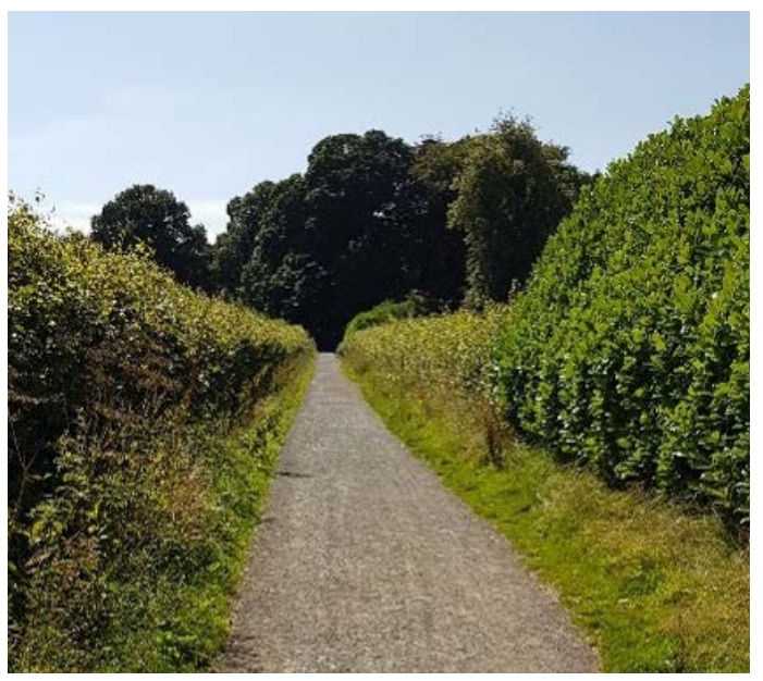
Figure 1 - Pathway before

Sections of the Loch Leven Heritage Trail are showing signs of suffering damage from wear and erosion due to loss of the whin dust surface leaving a vast expanse of exposed Type 1 material and sunken areas of the path where water is collecting, resulting in areas of an unpleasant surface for path users.