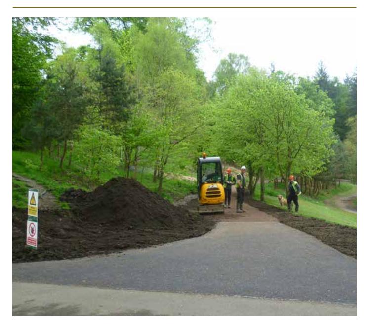
Transition zones between the new path and existing tracks through the wood needed particular attention to maintain the right gradient.