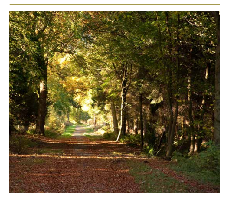
The trail passes through impressive beech woodland.

The review included access surveys at key visitor sites throughout Scotland. Over 200 kms of trails were surveyed and 18 phototrails (www.phototrails.org) were produced. The network of forest trails that were already "badged" as accessible to all were an important focus: we wanted to identify which of them met current specifications for accessible paths (see the end of this case study), and which might have fallen below the standard through the passage of time, erosion or other factors. We could then make decisions about improving existing routes, "de-badging" trails that were no longer fully accessible, renewed promotion of accessible trails, and the potential for developing new trails.