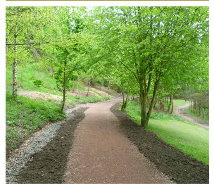
Covering the edges of the trail with topsoil will help them blend into their surroundings.

Comments from users have also been helpful since the path was built. We had always planned to install benches along the route at intervals of about 100 metres, but budget constraints, delays in making the benches and contract programming meant they didn't get installed until 2015. In the meantime, we were often asked if and when benches were going to be installed, so we know they really do meet peoples' need to sit and rest!