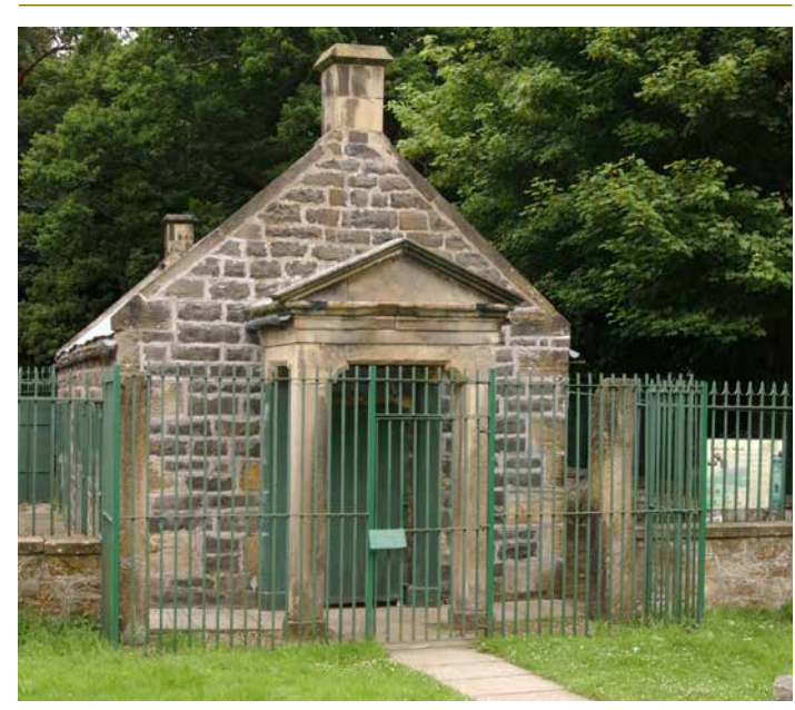
Please confirm what this building is for use in caption.

We also focussed on key forests with special landscape experiences that were already popular, but that did not offer fully inclusive access. That meant they could potentially exclude a large number of potential visitors: about 830,000 disabled adults live in Scotland, representing 1 in 7 of the population. And because most people follow "the line of least resistance" when out in the countryside, making sure trails are as accessible as possible benefits everyone.